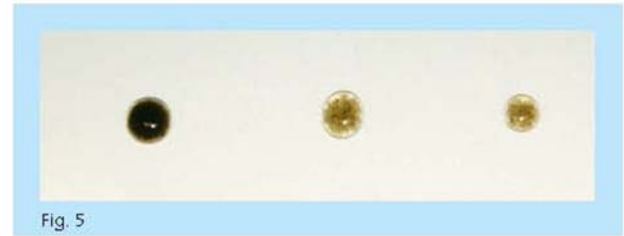
Figure 5. Treated settled sludge samples from the bottom of a lagoon appear darker than untreated settled sludge and mixed liquor suspended solids (MLSS). The dark color of the treated settled sludge sample (left) shows that it is further oxidized, which is an indication of increased biological activity compared to untreated areas (center). A drop of the MLSS (right) is shown for comparison purposes.

Figure 5 shows the difference in color between treated and untreated sludge samples. Increased biological activity results in a further oxidized and darker sludge.